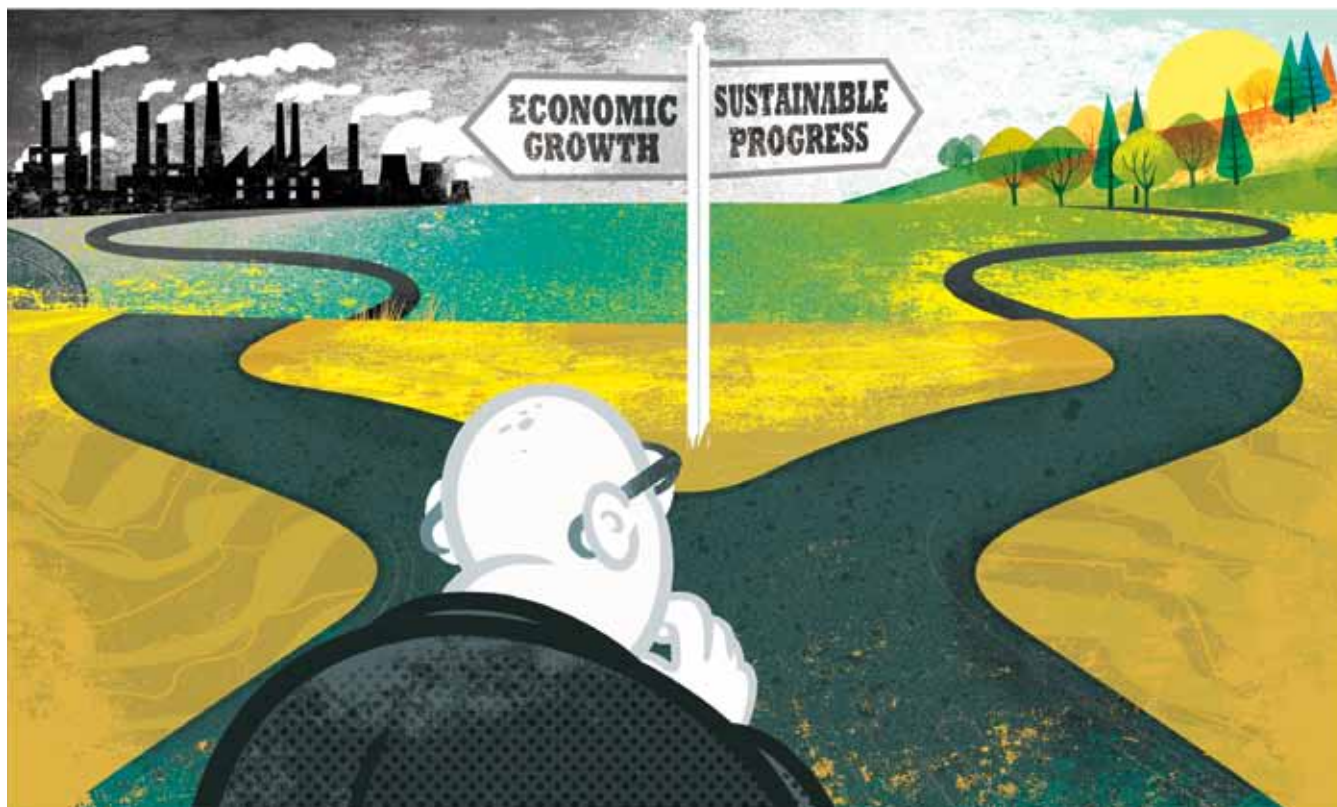
ILLUSTRATION BY PETE ELLIS/DRAWGOOD.COM

FUNDING Grant applications should feature multimedia presentations p.xxx